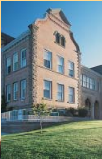
GREEN PARK ELEMENTARY SCHOOL