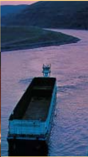
BARGE ON THE SNAKE RIVER