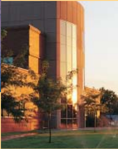
ARMY CORP OF ENGINEERS