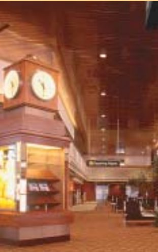
WALLA WALLA REGIONAL AIRPORT