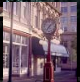
A REVITALIZED DOWNTOWN

It's true, we're famous for our wine, sweet onions and wheat. But these days we're most proud of our thriving economy, educated workforce and culture-rich and family-friendly community. It all adds up to a haven for multimillion dollar international industries and small businesses alike.