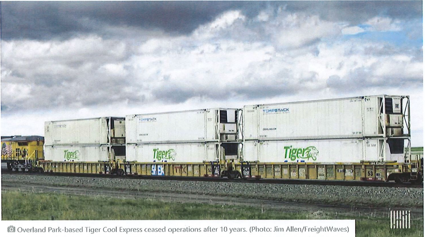
Overland Park-based Tiger Cool Express ceased operations after 10 years.

New details have emerged about Tiger Cool Express' financial health leading up to the company's abrupt closure on Tuesday.